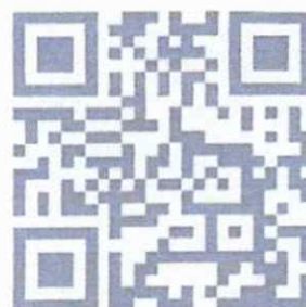
Facilitator's online Profile Form

Upon collecting the data, the BLSS-SSD shall generate a regional and division report to be sent to the Regional and Division Offices ESSD and SGOD Chief respectively.